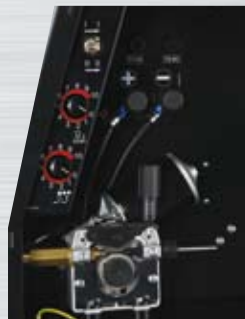
Professional wire feeding system and easy to change polarity

POWERTEC® Single phase range has been designed to meet Lincoln's standards of performance and reliability and come complete with a Lincoln three-year warranty on parts and labour